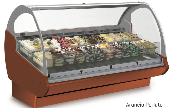
Arancio Perlato RAL 2013