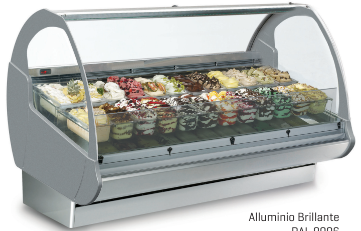
Alluminio Brillante RAL 9006 (STANDARD)

Gelato cabinets with ventilated refrigeration with double airflow for a perfect uniformity of temperature. One piece body with ecological polyurethane insulation (HCFC & HFC free), foamed with CO 2 . Tempered glass structure. Front and side panels insulated with anti-fog ventilation system with anti-scratch treatment.