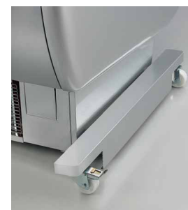
Wheel kit for easy handling